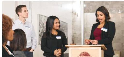
Table Topics. During Table Topics, all attendees have an opportunity to present one- to two-minute impromptu talks. This is often the most challenging and fun part of your meeting.

The order and length of these segments may differ from club to club. The length of a club meeting often determines the amount of time for each segment.